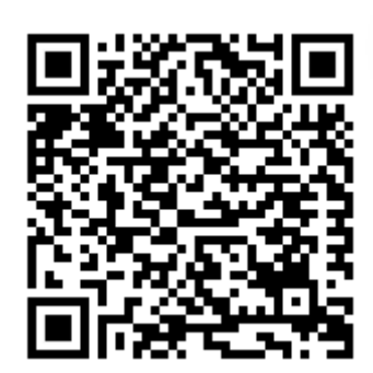
Visit us on the TCC Website

NONPROFIT ORGANIZATION U.S. POSTAGE PAID TULSA, OKLAHOMA PERMIT NO. 428